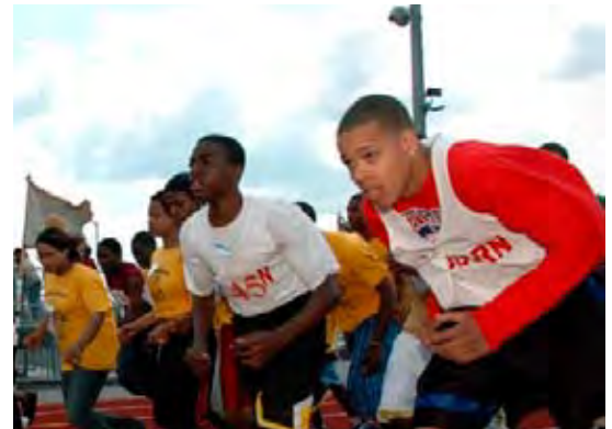
Cadets get ready to run.

After a run of 3.2 miles, all participants, including the young lawyers, were tired. But their efforts on a cool spring morning will last long beyond that day as the JROTC students learned that they can advance to college—and maybe law school—to better themselves and their community.