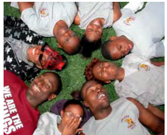
Inkster JROTC relaxing.