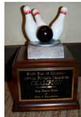
Bowling Champion Trophy

The Young Lawyers Section looks forward to successfully defending its title next year.