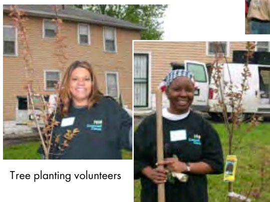
Tree planting volunteers