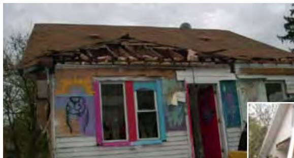
A former crack house being torn down.