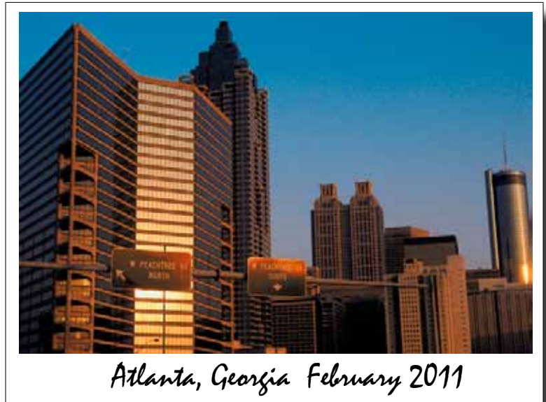
Atlanta, Georgia February 2011

See a complete list of the House of Delegates Resolutions.